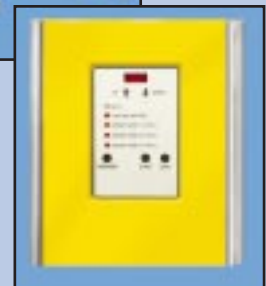
Solid State Programmable Controls