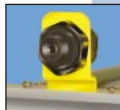
Non-Contact Infrared Temperature Sensor